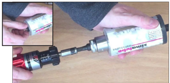
Screw in gas generator and tighten to 1.5-2.0 Nm