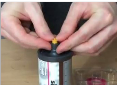
Insert the yellow non-return valve