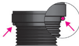
Check O-ring position