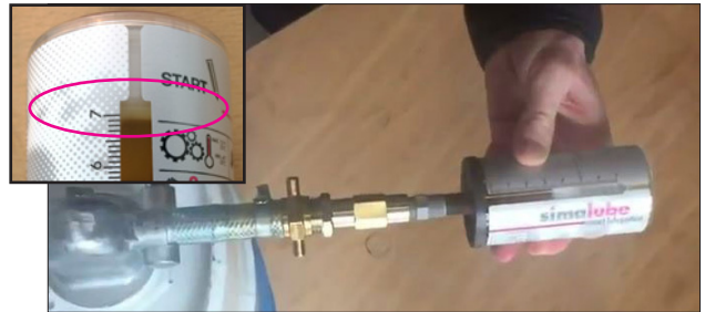
Fit the simalube onto the supply fitting and filling with oil. ⚠ Do NOT overfill!