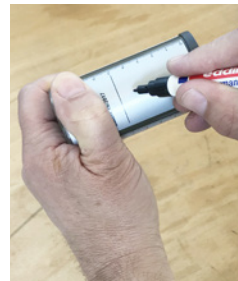
Mark lubricator with grease type